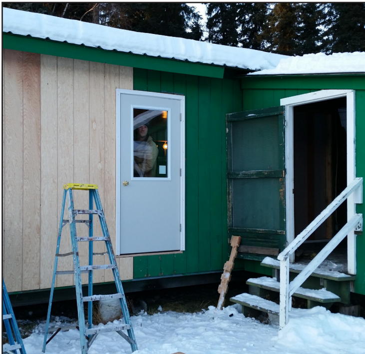
ACC Mike Hitte looks out of the new door at the recreation hall at Twin Bears Camp in Chena River SRA. The new door was installed to increase exit separation and meet code compliance. Adoorable!