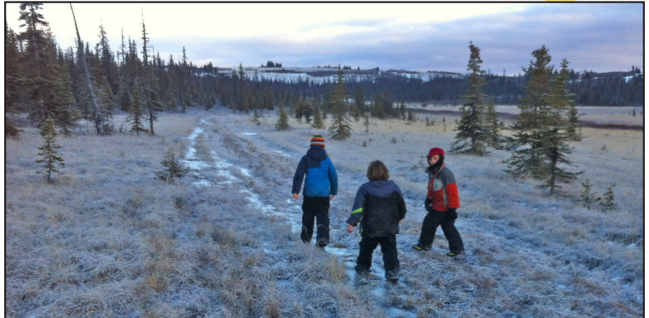
A group of kids leads the way on a First Day Hike in Eveline State Recreation Area, Homer